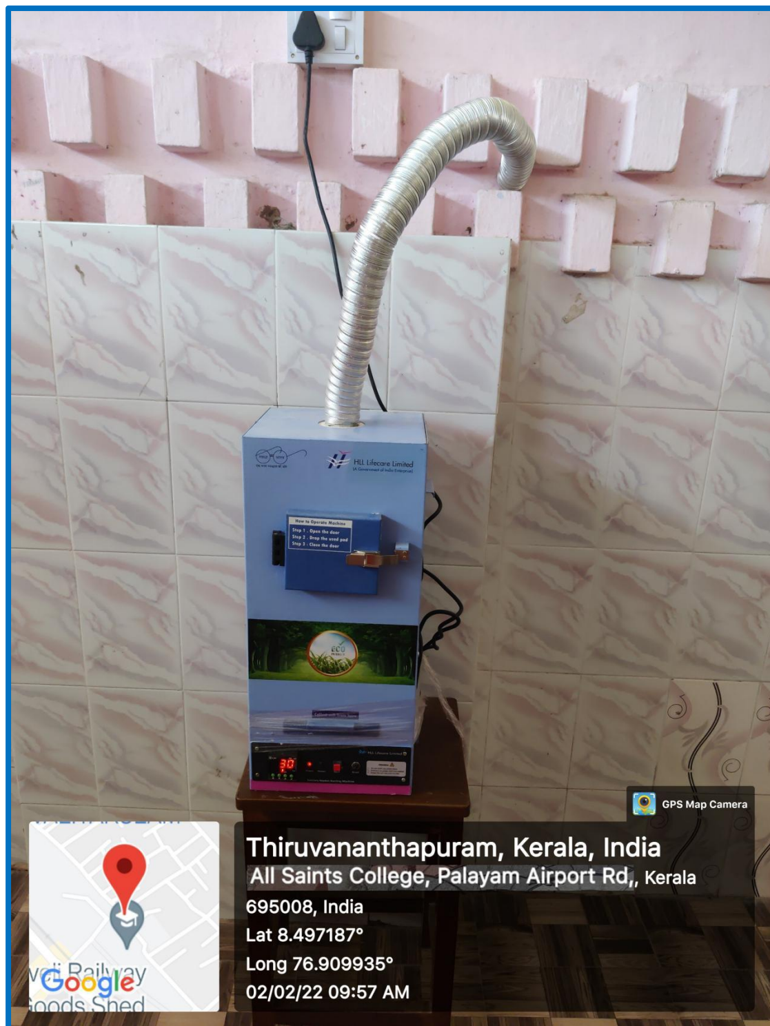
INCINERATOR (NO.3) INSTALLED IN THE STUDENTS' WASHROOM COMPLEX FOR THE SAFE AND HYGIENIC DISPOSAL OF BIO-MEDICAL WASTES