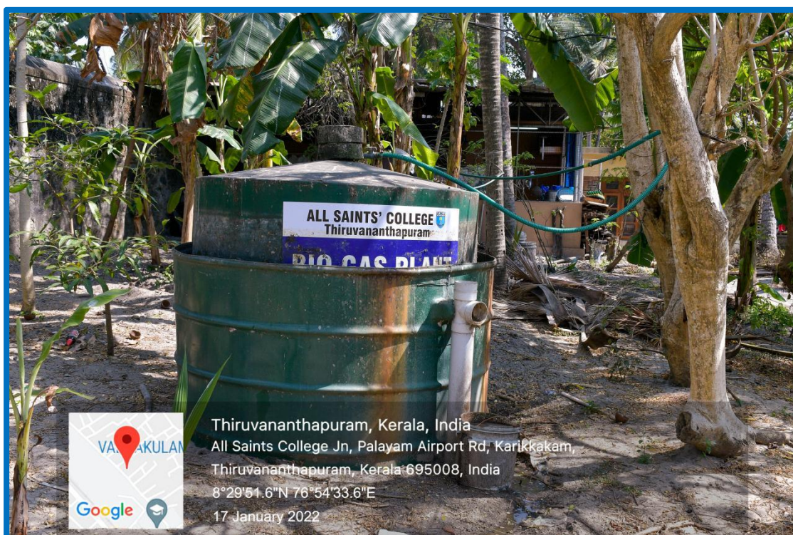
BIOGAS PLANT AT THE ALL SAINTS' COLLEGE CANTEEN UTILIZING SEGREGATED BIO-DEGRADABLE WASTE GENERATED IN THE CAMPUS