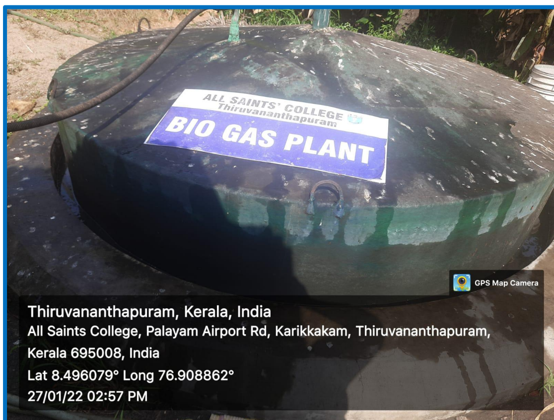
BIOGAS PLANT AT THE ALL SAINTS COLLEGE HOSTEL UTILIZING SEGGREGATED BIO-DEGRADABLE WASTE GENERATED IN THE CAMPUS