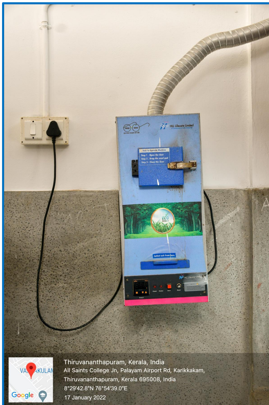
INCINERATOR (NO.2) INSTALLED IN THE COMMERCE BLOCK FOR THE SAFE AND HYGIENIC DISPOSAL OF BIO-MEDICAL WASTES